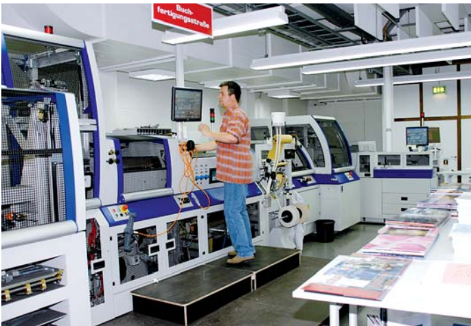
▲ BF 512 – 30 cycles/min improved operating concept with clearly arranged touch screen monitor

The ›1 copy specialist‹ – CeWe photo book production in Oldenburg with a 30 cycles/min book production line