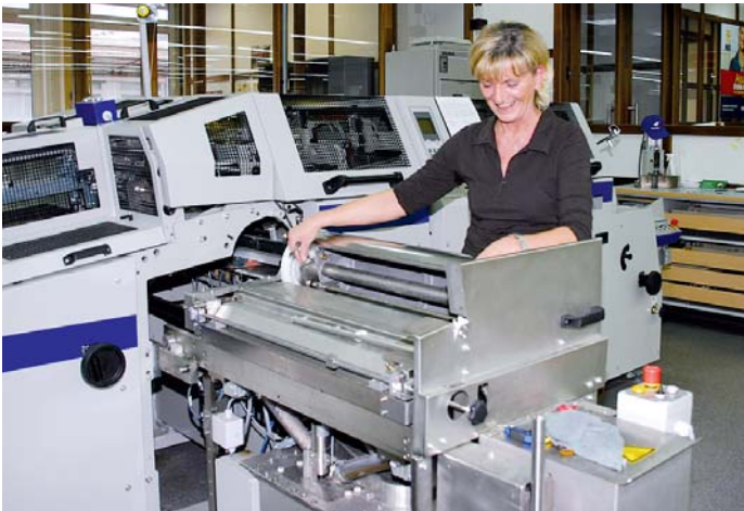
▲ DA 260 – 40 cycles/min to prepare for a different format the entire gluing system is pulled out and the required matrices are tightened onto the cloth cylinders with just a few quick movements.

Europe's largest photo finisher, CeWe Color AG & Co. OHG headquartered in Oldenburg, achieves the bulk of their turnover through analogue and digital film development. Since the beginning of 2006 the company has very successfully marketed the CEWE PHOTO BOOK. With a wide variety of products CeWe offers customers, among others, various forms for processing their image data – from photo booklets to brochures to high-end hard-cover products. Demand for the CeWe photo books increased so rapidly that existing production methods could not keep up with the necessary production. This led to the timely decision in Oldenburg to incorporate fully automatic manufacture of hard-cover photo books and represented their debut into industrial book production.