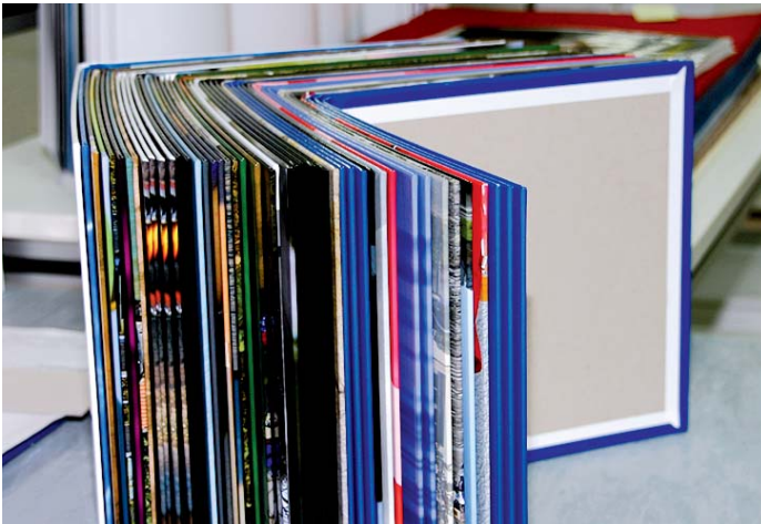
▲ CEWE PHOTO BOOK – Case production starting from copy 1