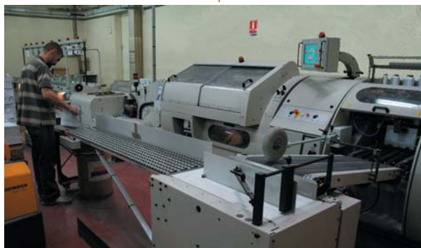
The first of the two Uniplex lines installed at SNDF (France), equipped with an Aster 180 book sewing machine and 8 stations MX4 gatherer.