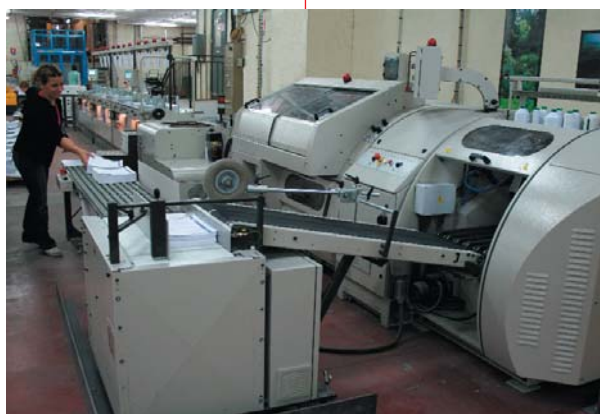
The second Uniplex line installed at SNDF, fitted with an Aster 180 and a 12 stations MX4 gathering machine.

With the recent update of its machineries SNDF proves to have a market-oriented strategy, by achieving the highest level of technological development available on the market.